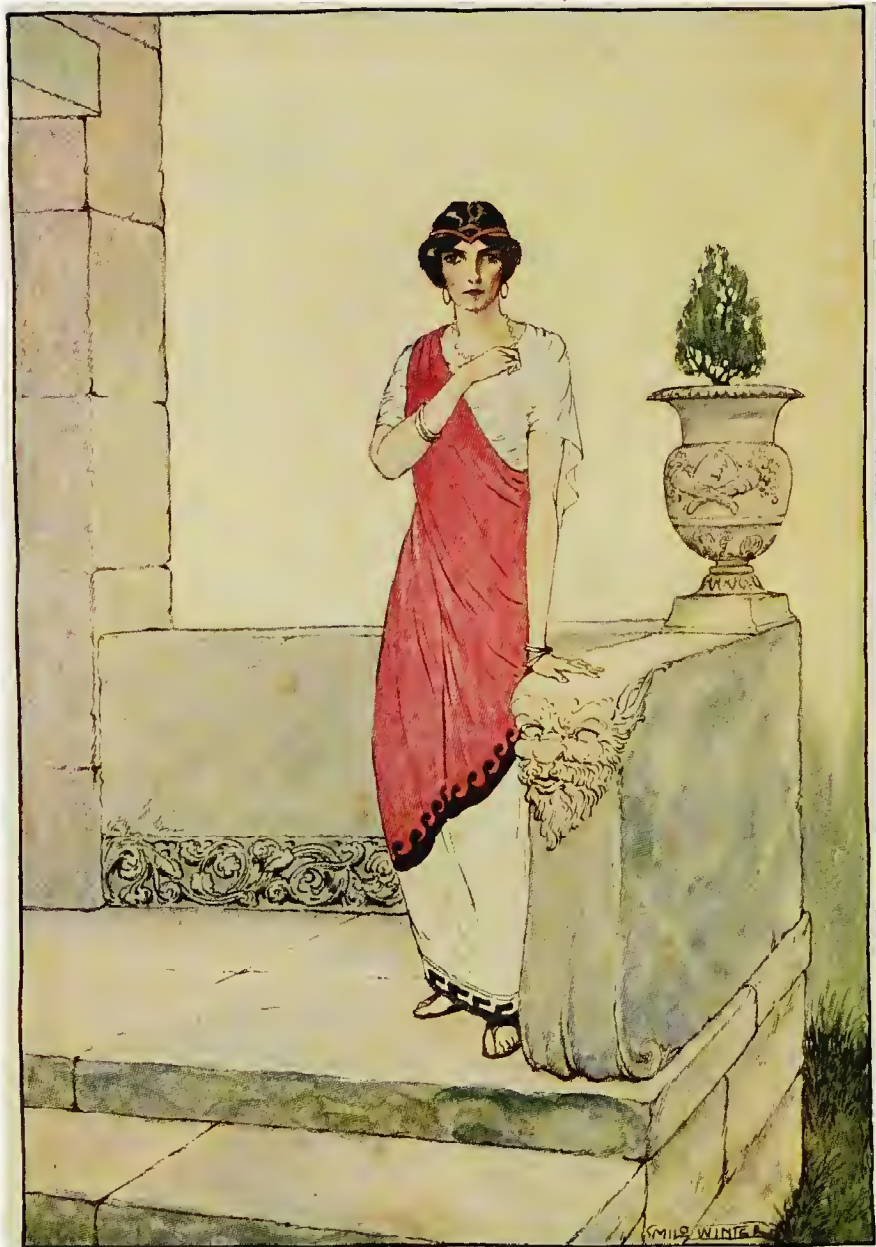
She was one of those persons whose eyes are full of mystery